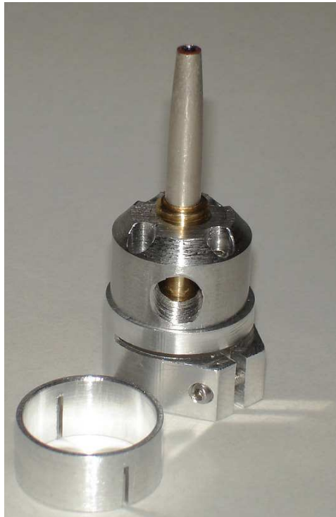
Fig. 1. From top: LoMAX optic, electron trap (with magnets removed), ring clamp, and clamp adaptor.

For this test, a LoMAX optical assembly was installed over the EDS electron trap. Normally, the electron trap on the EDS is removed and replaced by the LoMAX electron trap / optic assembly. Since the electron trap was not removable on this EDS, the magnets were unscrewed from the LoMAX electron trap, and the entire assembly was mounted at the end of the EDS and aligned. Gains of almost 10X were observed for Be. Results follow.