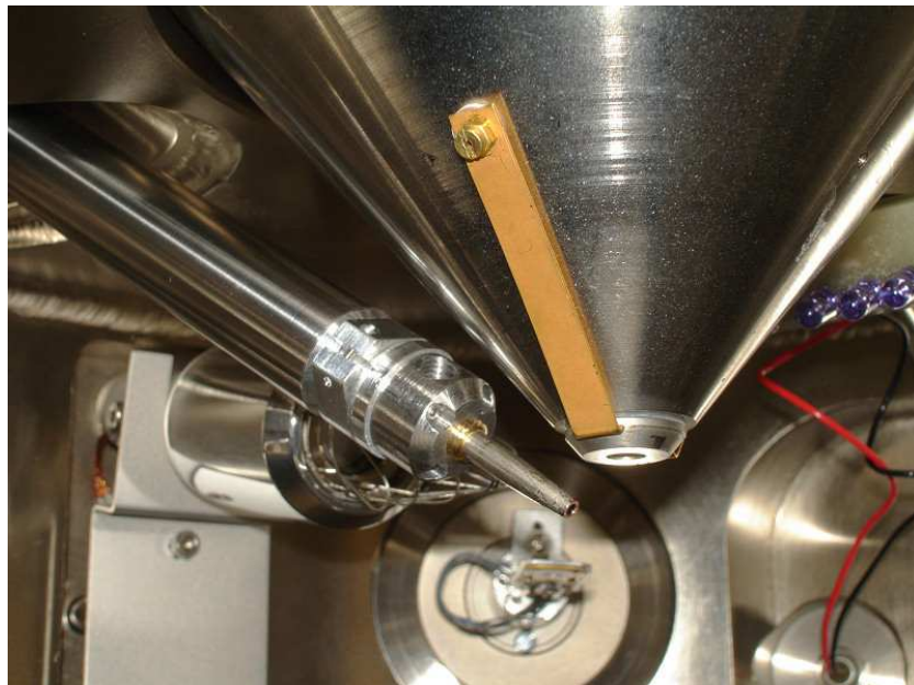
Fig. 4. LoMAX mounted on EDS in ZEISS SEM chamber