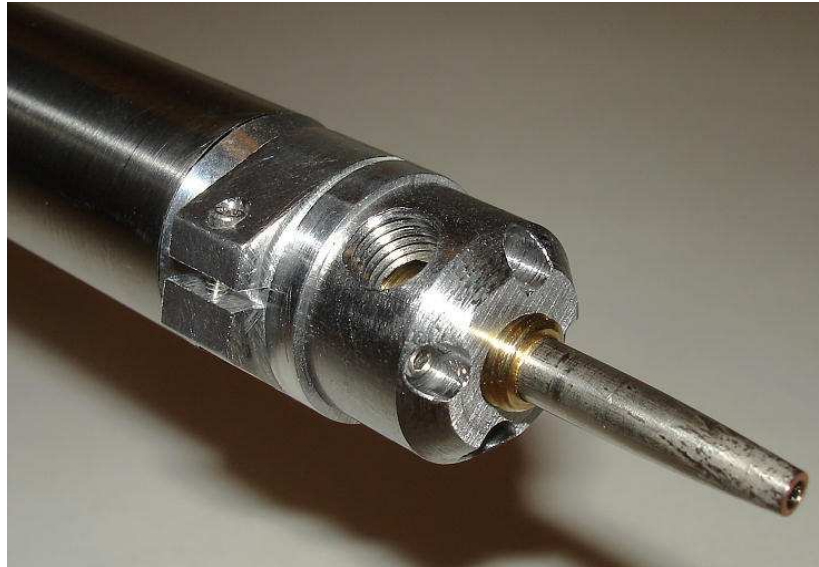
Fig. 3. LoMAX assembly mounted on EDS Detector, provided by remX GmbH