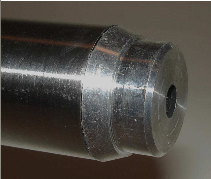
Fig. 2. EDS e2v SDD detector from SAMx with electron trap